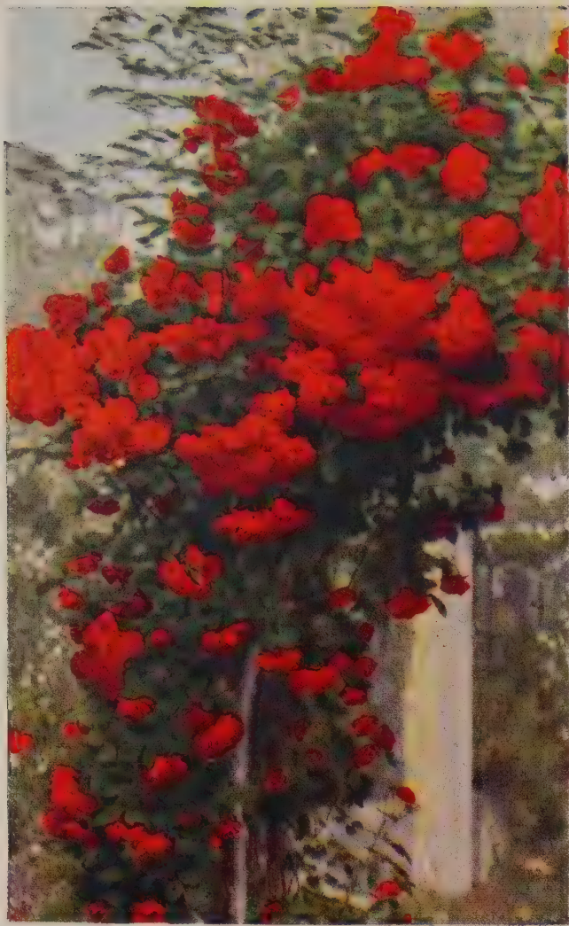
COPYRIGHT BLAZE (CLIMBER)—$1.25 each; 3 for $3.15

KING MIDAS —Plant Pat. No. 586. Deep gold flowers which are high-centered, tight buds and lovely large full flowers in clusters of four to six on a stem. Long-lasting, excellent for cutting. Plant vigorous in growth and richly clothed from the ground up with dark green leathery foliage. $1.50 each, 3 for $3.75.